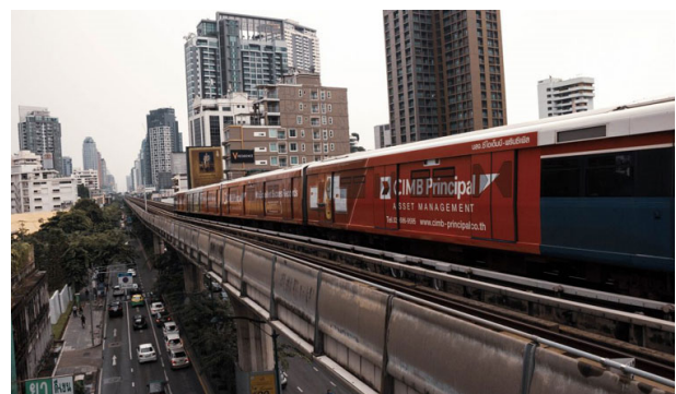
BTS SkyTrain in Bangkok

The feasibility study of the Monorail Way and Subway project for Phnom Penh has been completed, according to the Minister of Public Works and Transport. The MWPT cooperated with the Japan International Cooperation Agency (JICA) to plan the development of the Electronic Data Interchange (EDI) Port project, the upgrades to the Phnom Penh Autonomous Port, and the development of a mass railway transport system. The absence of a mass transport system remains a much-needed development sector in light of Phnom Penh's rapid city growth and expanding middle class. While a growing road traffic volume may indicate increasing economic activity, there are drawbacks such as increased travel time, fuel